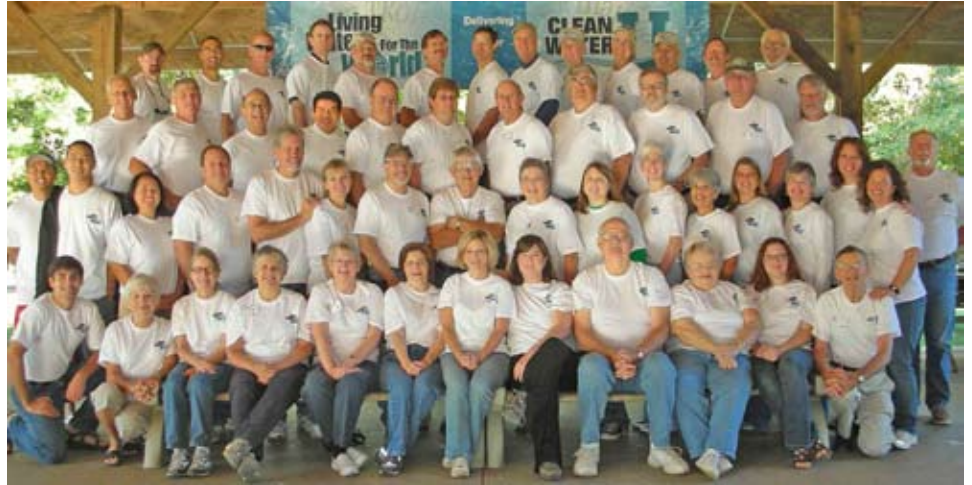
Hopewell had 43 students camp from nine states and from Mexico.