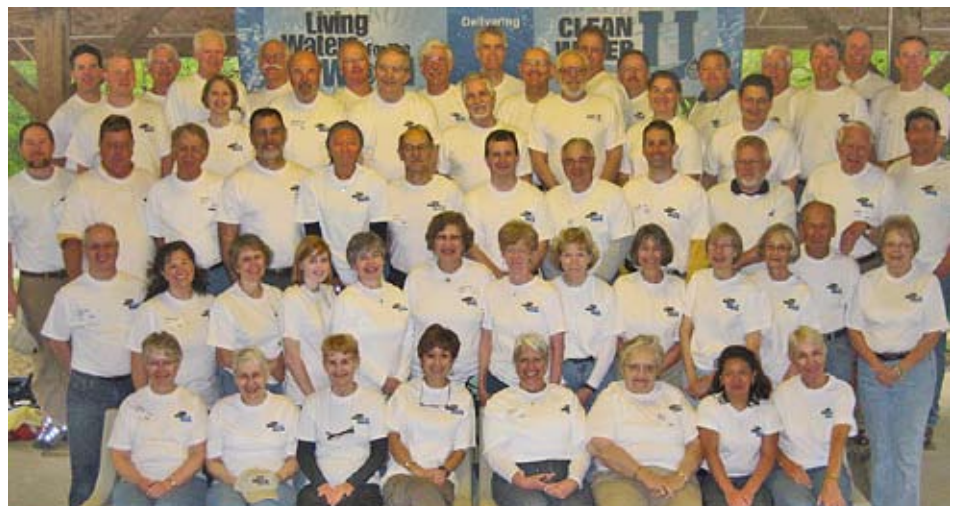
Forty students from 10 states and Guatemala raised CWU's all-time student count to 884.