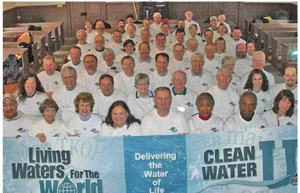
Indoors on a cool, rainy day: 40 students from nine states and Mexico