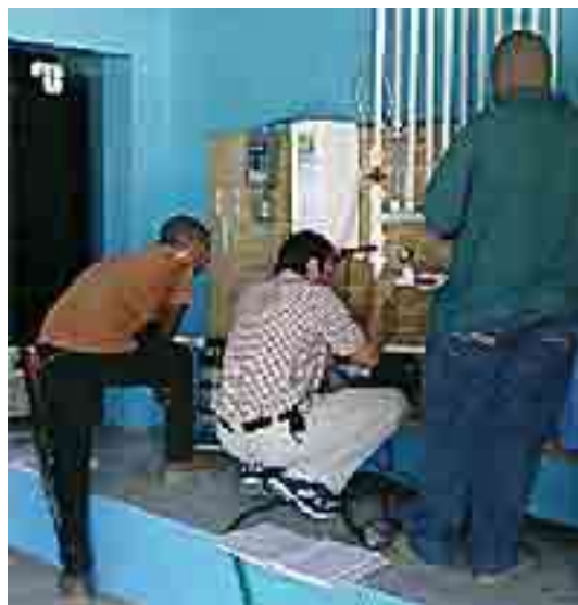
Installation at Finca 6, near Azua, D.R., September 2008.

Sometimes things do take a little longer,