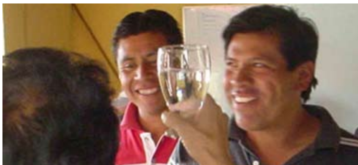
Good water brings big smiles in Guatemala.